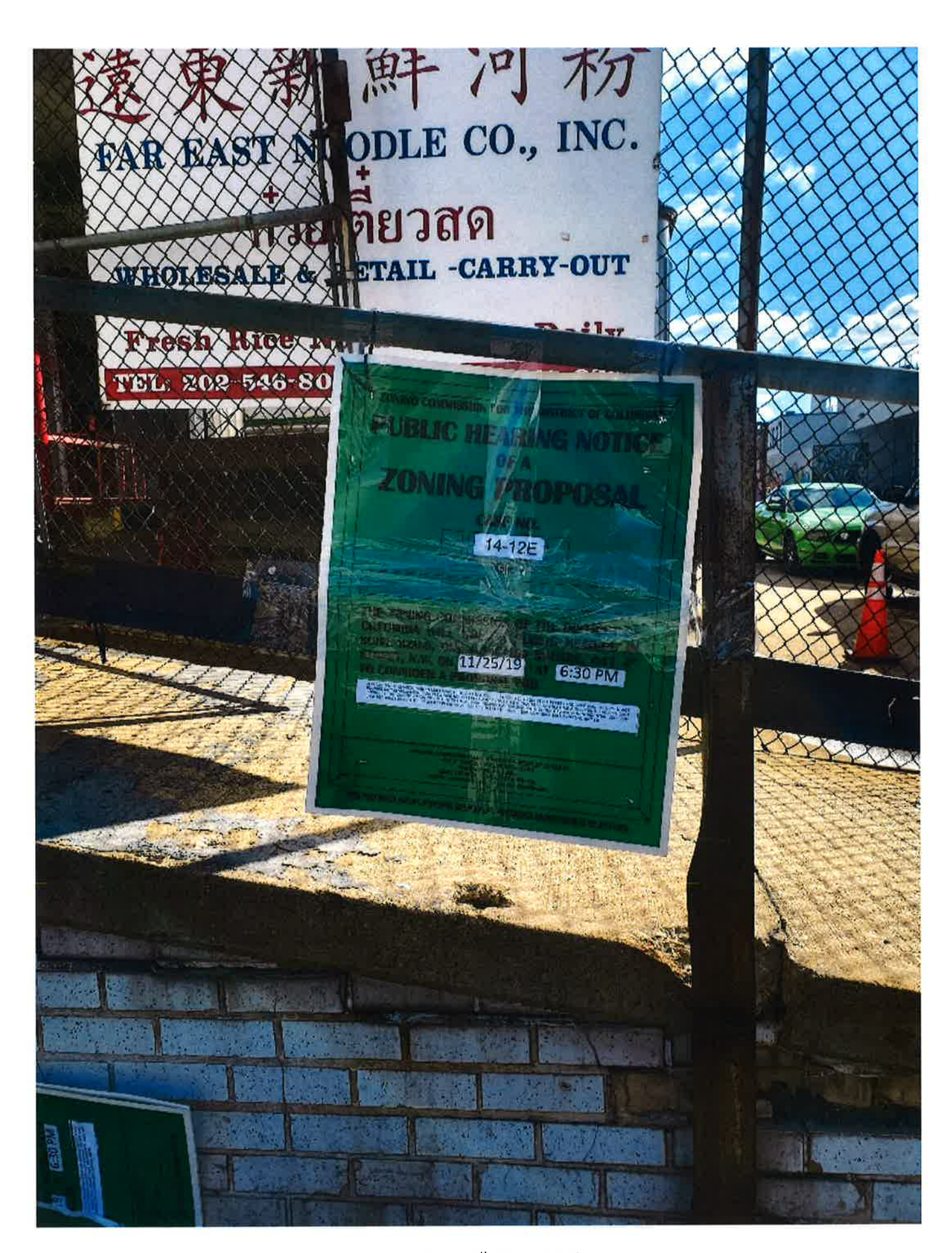
11/1/19 - 5th Street NE