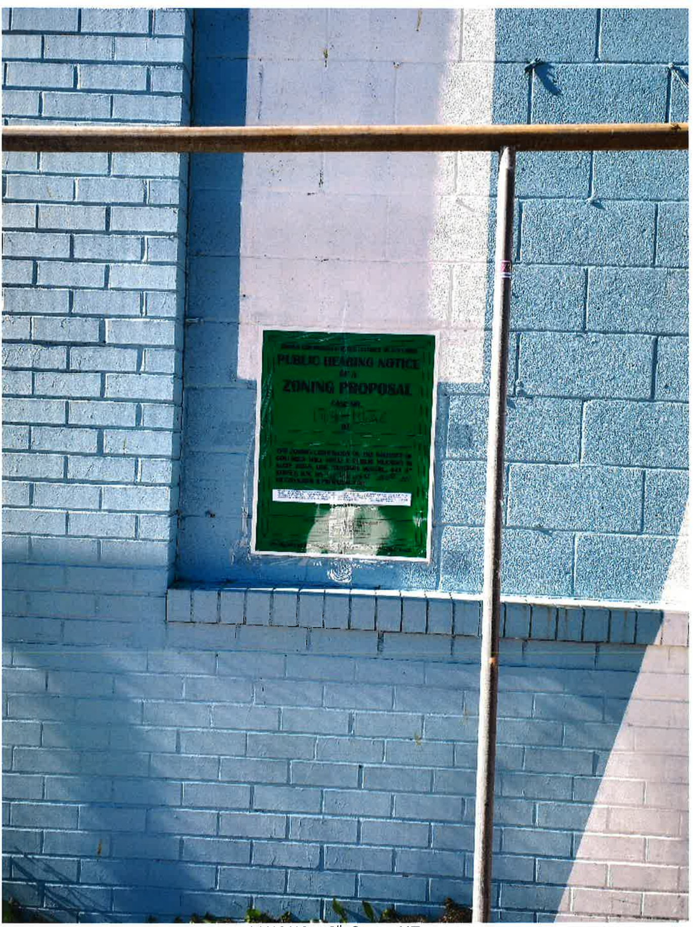
11/13/19 - 6th Street NE